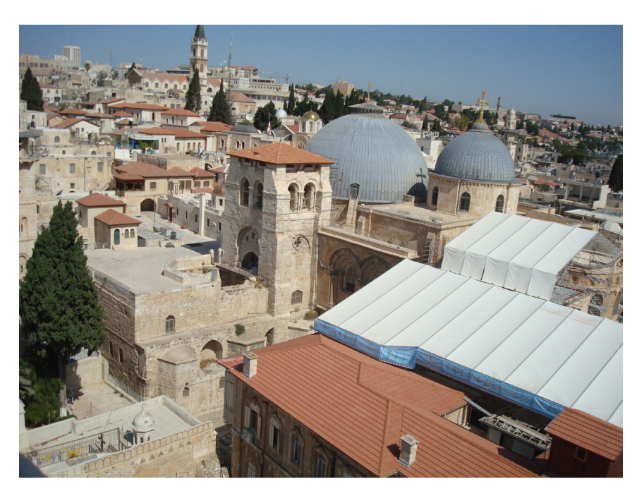
Figure 5. Holy Sepulchre in Jerusalem.