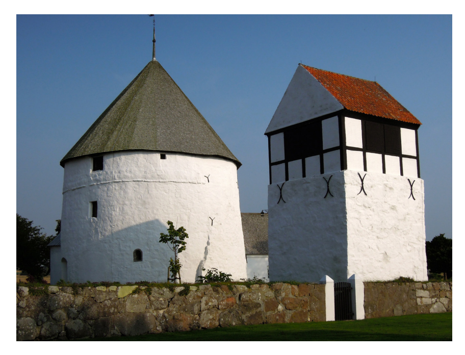
Figure 7. The church of Nylars on Bornholm, Denmark.