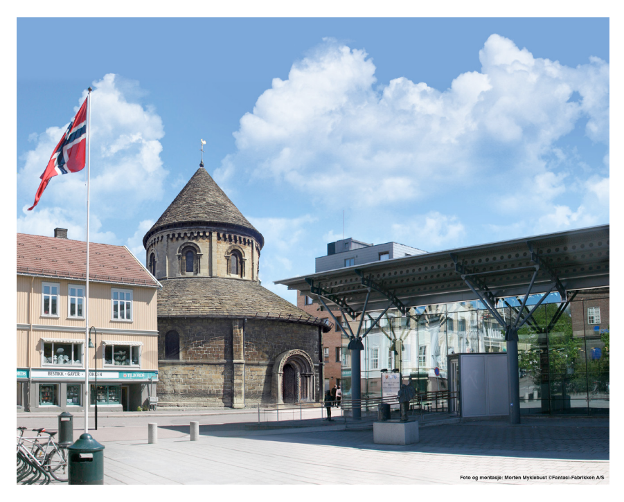
Figure 11. The Holy Sepulchre in Cambridge relocated to present-day Tønsberg.