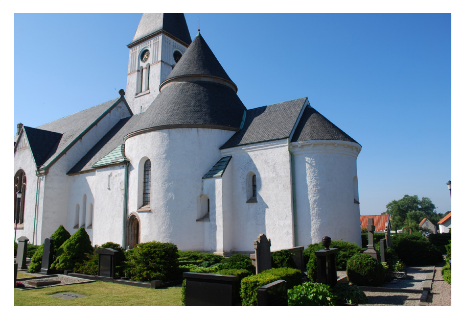
Figure 6. The church of Valleberga in Scania, Sweden.

used as accommodation for travelling knights or pilgrims, for meetings in the Canute Guilds or storage of equipment used in the crusades (cf. Wienberg 2004: 38–40, 43–44).