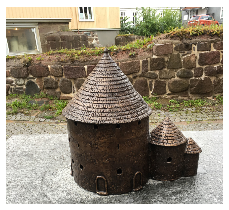
Figure 3. Model of Saint Olav's in Tønsberg as a copy of Nylars on Bornholm.

The concept of defensive churches developed in the nineteenth century and culminated in the decades around 1900, i.e. in a period when land-based fortifications were a subject of political debate. This was the context for the art historian Hugo F. Frölén, who interpreted all round churches as fortified in his ground-breaking two-volume dissertation Nordens befästa rundkyrkor ('The Fortified Round Churches of Scandinavia' Frölén 1910–11). The idea that many churches were fortified was, in fact, strongly challenged even when it was at its most popular, particularly by scholars who pointed out that churches were unconvincing as defensive units compared to contemporary castles (e.g. Blom 1895; Mowinckel 1928), but it was difficult to dislodge. The concept of defensive churches remained popular through the twentieth century (Wienberg 2004). It was simply a good story to tell.