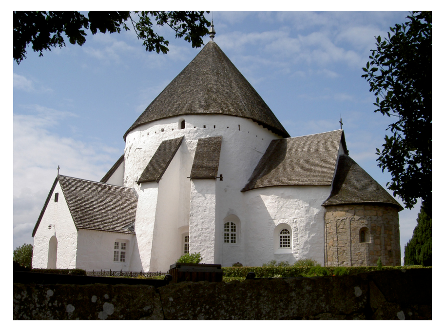
Figure 4. The church of Østerlars on Bornholm, Denmark.