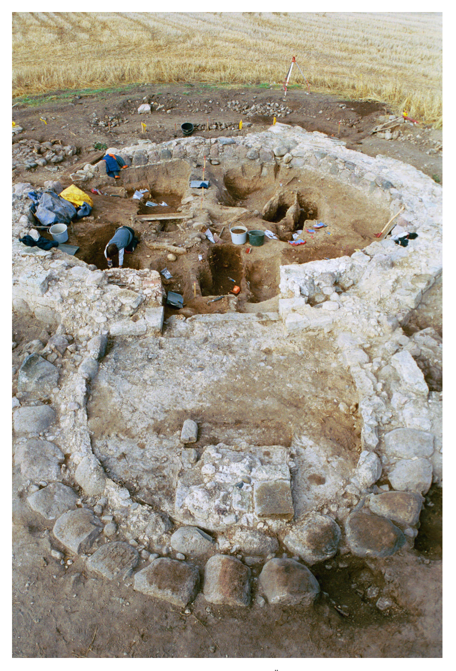
Figure 9. The excavation of the round church of Klåstad in Östergötland, Sweden.