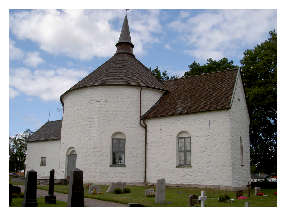
Figure 10. The church of Voxtorp in Småland, Sweden.

and have been disputed (Wienberg 2014: 215–218; Bonnier 2018: 70; also Beseler 1985: 71–72).