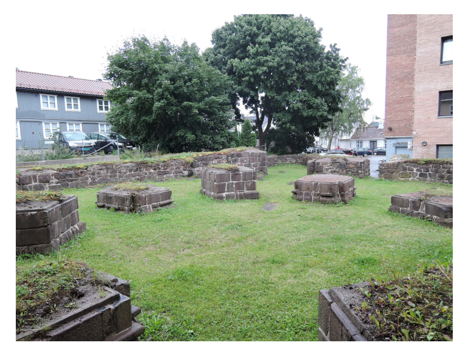
Figure 1. Round church of Saint Olav in Tønsberg, Norway.