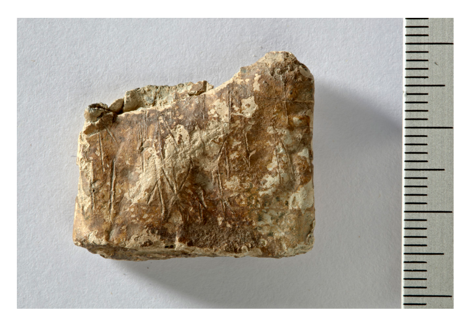
Figure 2. Folded lead plate with runic inscription, medieval Tønsberg. Only a third of the runes are visible: eluas ut and hac famula dei, amen . The plate was probably used as an amulet by a woman from Tønsberg.

the Catholic church or European culture in the Middle Ages. The two remaining churches in Tønsberg that survived the Reformation had recently been torn down: a new cathedral had been consecrated at the site of the Church of St Lawrence in 1858, and in 1864 the St Mary's had to give way for the new town hall in the central square. On the other hand, there was a growing interest in Norwegian medieval history, not least because of the struggle for independence from Sweden. There was a new narrative: Norway as an independent kingdom with a glorious and heroic past from the Viking Age, at least up to the fourteenth century, became important for an awareness of Norway's status as a nation. The sagas of Snorri Sturluson about the kings of the past became popular reading, and also a support for the study of antiquities and the conservation and restoration of medieval architectural remains, including churches. The Society for the Preservation of Ancient Norwegian Monuments (Foreningen til norske Fortidsminnesmerkers Bevaring) was established in 1844, saving several of the iconic wooden stave churches from the same demise as the medieval churches had suffered in Tønsberg.