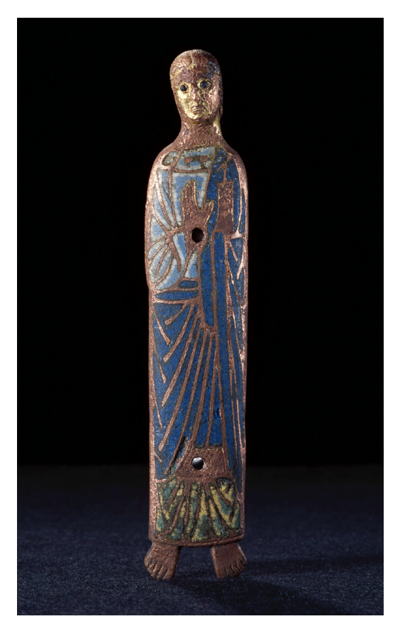
Figure 4. A figure, possibly a female saint attached to a reliquary, made in Limoges, St Lawrence's Church, Tønsberg.

would come from (Jer 1, 13–14). The prophet had once promised that God would finally overturn the reign of the 'boaster' in the north and 'build His city' even in these remote realms. The same allusions are found in the Nidaros sequence Postquam calix Babylonis , probably composed in the late twelfth century. Here, a subtle wordplay is made; the seething pot ( ollam ) of the north, as mentioned by Jeremiah, is no longer filled with evil, but with the good oil ( oleo ) made by St Olav. In this sequence, the sacred topography seems turned on its head. The Northmen, when in the service of the Christ-like St Olav, become God's assistants against the wicked in the south, namely the city of Babylon (Kunin & Phelpstead 2001, 26–31; Skånland 1956; Kraggerud 2002).