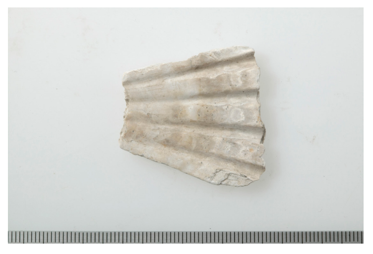
Figure 5. Fragment of a scallop, probably a pilgrim badge supposed to be from Santiago de Compostela. Found at Storgaten 16–18, Tønsberg, close to the St Olav's Abbey.