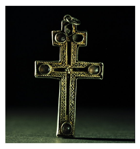
Figure 9. Reliquary cross, Byzantine style, late eleventh or twelfth century. It was found in the 1870s during the digging of a ditch in central Tønsberg, close to St Mary's Church and not far from St Olav's Abbey. A small piece of wood is still preserved inside, by some interpreted as the relic of the Holy Cross brought back to Norway by Sigurd the Crusader in the early twelfth century.

The True Cross relic from Konghelle is said to have reached Nidaros. However, a cross relic with a pendant attached to it, indicating that it was intended to hang around the neck, was found in a ditch during construction works in Tønsberg in the late nineteenth century. Traces of a small piece of wood still remain in it. Its provenance is disputed, but the style is conventionally considered to be in a Byzantine style and dated to the late eleventh century. Whether or not this is indeed the True Cross relic given to King Sigurd during his stay in Jerusalem remains a matter of debate.