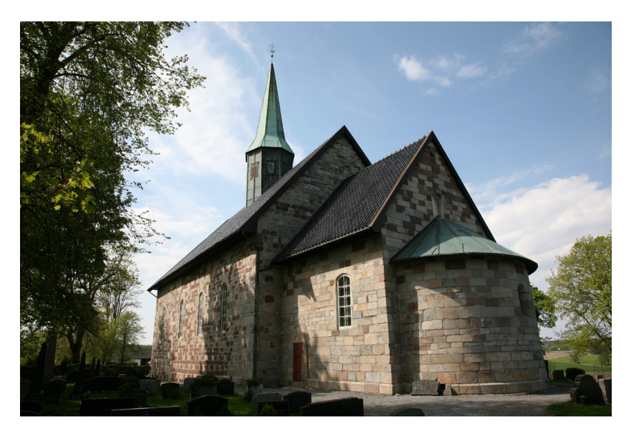
Figure 8. Rygge Church, Østfold.

putting it in the context of the reign of King Sigurd the Crusader, after returning from his journey to the Holy Land.