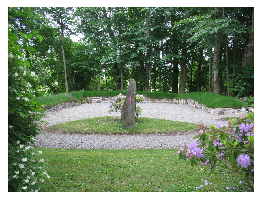
Figure 7. Varna Commandery, Østfold.

As in the case of the round church in Tønsberg, this house is the only one of its kind in the Norwegian kingdom. Its foundation on the eastern side of the Oslo Fjord cannot be dated precisely from textual sources, and the ruins are poorly preserved and have never been properly excavated. The earliest textual reference is only from the late thirteenth century, when it was used as a hospital for retired retainers at the royal court. However, as Trond Svandal argues in his article in this volume, there are other elements that strongly indicate that the Hospitallers had already come to Varna by around 1170. This would make Varna contemporary to the round church and abbey in Tønsberg, and Svandal's revision of the founding history of Varna places these other foundations in a wider context.