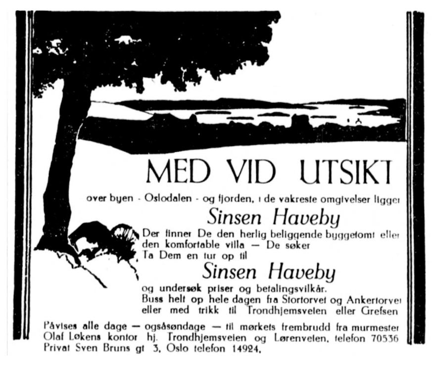
Figure 17. A newspaper advertisement from November 1932 announcing the arrival of Sinsen Garden City.

was included in the regulation plan; perhaps not formally, but at least for contextual purposes. This demonstrates an awareness right from the start about the mutual dependence of these areas.