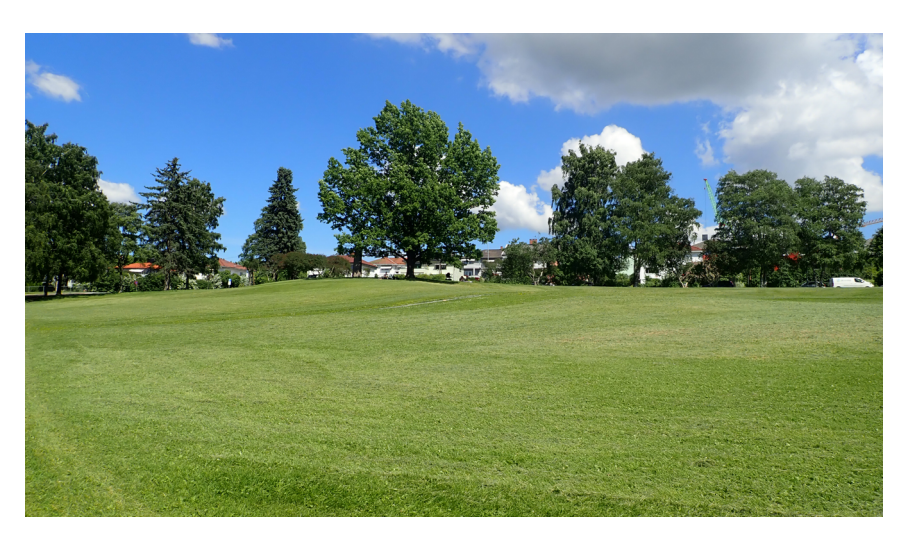
Figure 22. Sinsenjordet, the local park, in June 2022.

that a crucial piece of the cultural history is still present, the park also has a World War II memorial in remembrance of all the local Jews who were deported to concentration camps during the war. The park is, in other words, a hugely important landmark and an invaluable asset for people who live in the area. It is a place where children can play, teenagers can hang out and adults can socialize outdoors, relieved for a while from work duties, social media and computer screens.