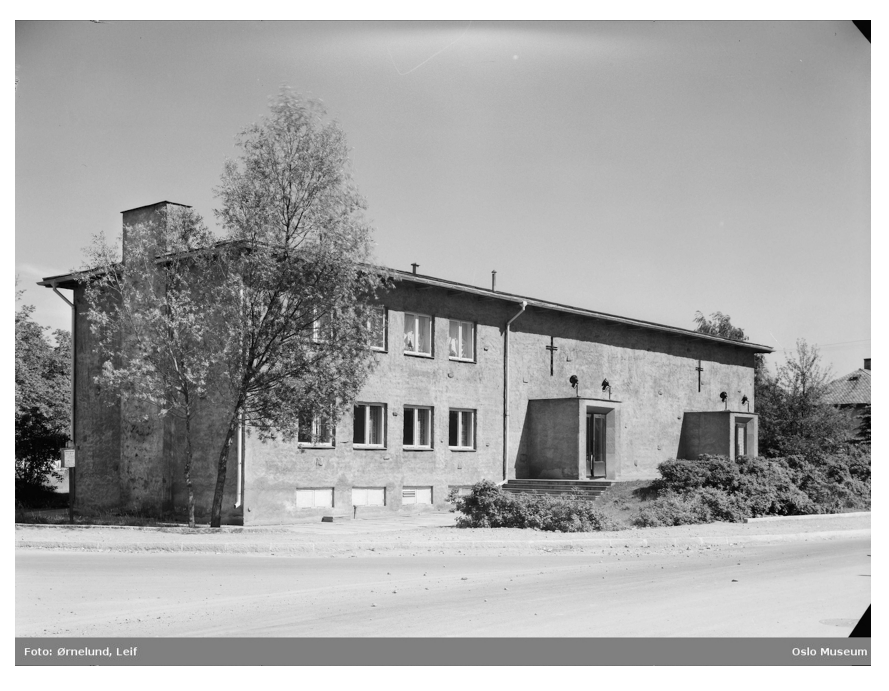
Figure 21a. Lørenveien 2, a prayer house in 1956. Photo: Leif Ørnelund/Oslo Museum (OB.Ø56/1569).

For some jobs, like the roof repairs, professionals are needed. But another sustainable aspect of timber architecture of this kind is that it can be kept in good condition by the residents themselves, through fairly manageable caretaking routines like painting and other forms of damage prevention. Of course, not everyone likes to carry out maintenance and it can cost more than you expect, but it is nevertheless a fairly small sacrifice. Most people who own a property accept the investment and effort it takes to care for it, especially since good maintenance is favorable for the economy as well as the environment.