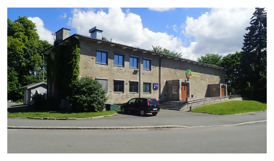
Figure 21b. Lørenveien 2 in 2022, a locale for cultural activities for teenagers.

Not every house is made from timber, however. In fact, a closer look at Sinsen Garden City reveals a number of discrepancies that makes it difficult to define conclusively. Two buildings stand out completely due to the choice of materials: brick instead of timber. One of them is situated at Lørenveien 2 (Fig. 21), which currently serves as a locale for cultural activities for teenagers. It was originally built to be a prayerhouse and residence, custom-made to suit that combination in 1937 by Hugo A. Brustad, who was an architect and mason. He created a support system of brick and cast-concrete decks, and the façade was painted brick. The building was described thus in Aftenposten in 1941: "At the very entrance to Sinsen Garden City stands a strange brick house. It has a huge chimney above the gable and two covered side entrances."129 How very strange indeed. The other oddity in the neighborhood is a brick house at Breisjåveien 33, designed by architect Trygve Gierlöff. This single-family residence was commissioned by a mason, Holst-Larsen, who had formal responsibility for the building application. He thereby had a direct influence on the construction system and finishings.