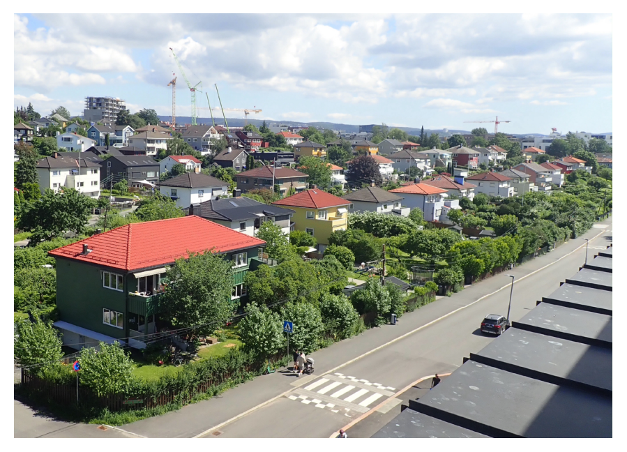
Figure 20b. Sinsen Garden City viewed from the school roof in June 2022.