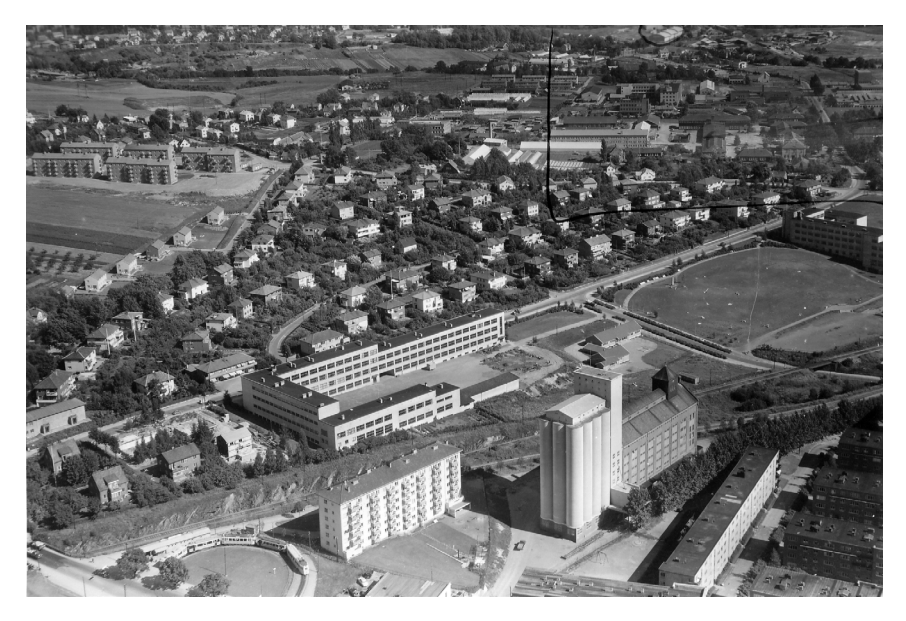
Figure 16. Aerial photo of Sinsen Garden City, 1952. Photo: Widerøes Flyveselskap/Otto Hansen, © Oslo byarkiv. Reproduced with the permission of Oslo byarkiv; this image cannot be reused without permission.

was the presence of three major traffic arteries to the north, west and south of the garden city: Trondheimsveien, Ring Road 3 and two railroad tracks. Those barriers have been there almost from the start and they have expanded over the years.<sup>114</sup> They provide mobility, but they also bring noise and physical isolation. Sinsen Garden City has been a green, secret haven surrounded by traffic machinery ever since it first emerged.