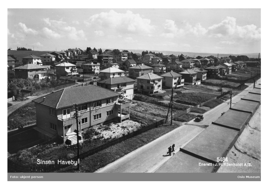
Figure 20a. Sinsen Garden City viewed from the school roof in the late 1930s.