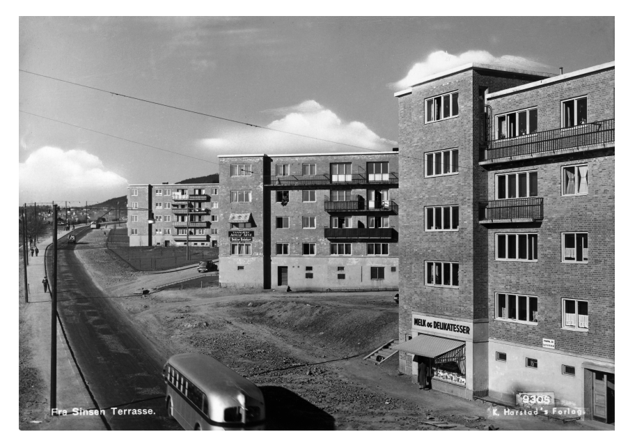
Figure 15. A photo of Sinsen City in the late 1930s, when the neighborhood was brand new. Photo: Karl Harstad/Oslo Museum. Reproduced with the permission of the Oslo Museum; this image cannot be reused without permission.

typical of the architectural trends in Oslo at the time. Prior to its creation, the land belonged to a historical farm at Sinsen, Sinsen Farm [Sinsen Gård], which the wealthy Schou family sold to a building company called the Johnsen Brothers [Brødrene Johnsen] in 1934. They wasted no time: Three construction stages, 2,500 flats and 10,000 people were all in place by 1939 (Fig. 15). It was the largest construction project in Norway at the time and must have looked rather impressive upon its completion.<sup>112</sup>