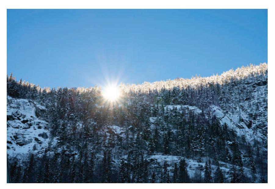
Figure 4. The Sun Mirror seen from the town square. Rjukan, 2019.

sun—but rather to promote the sun in itself as life-giving and vital for us humans.