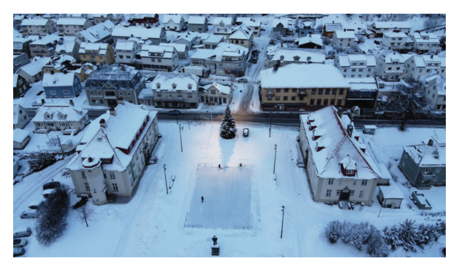
Figure 3. The Sun Mirror lights up the Christmas tree in Rjukan, 2019. Photo: Liv Gunhild Fallberg.

Figure 2. Martin Andersen. (2013). The Sun Mirror . Rjukan, 2019. Photo: Daniel Larsen. © Martin Andersen/BONO 2021. All rights reserved. The image is not covered by the CC-BY license and cannot be reused without permission.