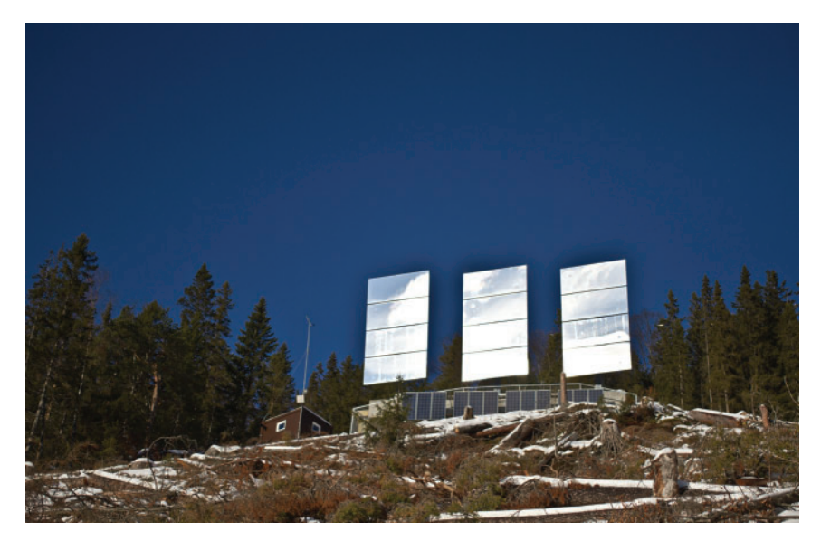
Figure 2. Martin Andersen. (2013). The Sun Mirror . Rjukan, 2019. © Martin Andersen/BONO 2021. All rights reserved. The image is not covered by the CC-BY license and cannot be reused without permission.