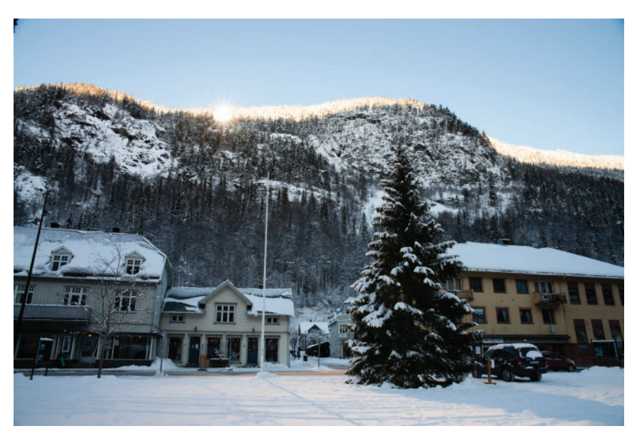
Figure 5. The Sun Mirror seen from the sunny spot in Rjukan's main square 2019.