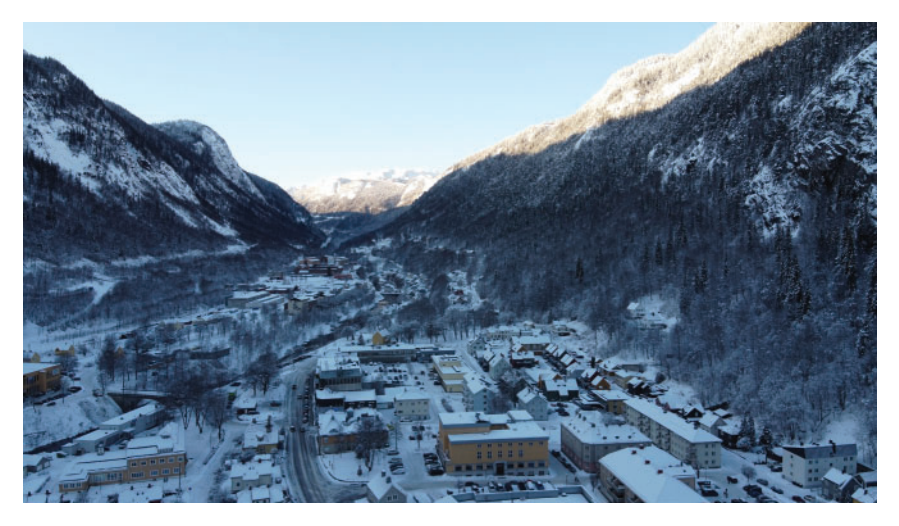
Figure 1. Photograph of Rjukan in wintertime shade. The shadow line on the mountain is visible. 2019.

creating a physical division across the mountain ranges. The closer it gets to October, the higher the separating line between light and shadow moves up the hillside. The opposite happens in spring. Houses placed higher up in the valley can enjoy the sun for approximately a month longer than the houses built at the bottom of the valley (Taugbøl & Andersen, 2015, p. 74). The inhabitants know very well when the sun hits their own window edge (Fjeldbu, 1995, p. 5). On March 12, the sun's rays finally reach the old workers' bridge after a long winter. This is one of the annual highlights for the inhabitants of Rjukan and each spring a grand celebration called Solfesten [the Sun Festival] is organised to pay tribute to the sun.