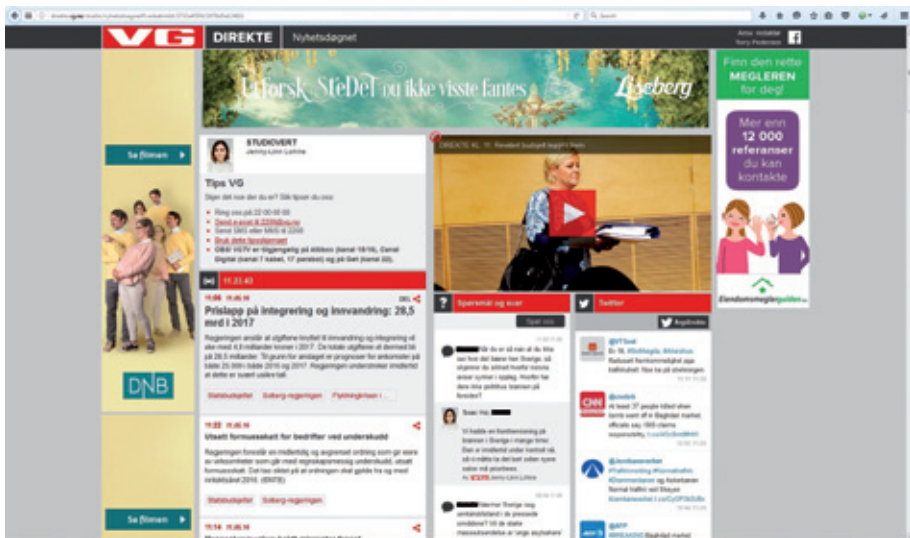
Figure 7.2. VG Direkte Nyhetsdøgnet 11.5.2016 11.25 a.m. Facsimile reproduced in accordance with the Norwegian Copyright Act.

Nyhetsdøgnet proved itself viable. Towards 2016, VG.no narrowed and simplified the interface and included commercials, while keeping the mix of news updates, tweets and questions and answers (figure 7.2). Overall, Nyhetsdøgnet settled in as an integral part of VG.no . An important part of this process was the continuous and implicit negotiation between readers and journalists about which kinds of questions and answers they considered relevant and appropriate, and which interpersonal style they were supposed to use.