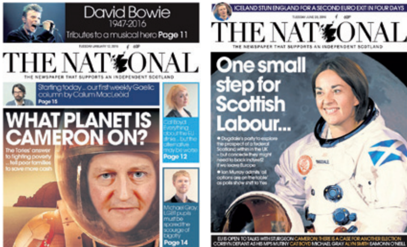
Figures 6.17 & 6.18. David Cameron and Kezia Dugdale on another planet. Facsimiles reproduced in accordance with the Norwegian Copyright Act.

Individuals presented as “out of touch” can appear as spacemen/women (David Cameron and Kezia Dugdale below):