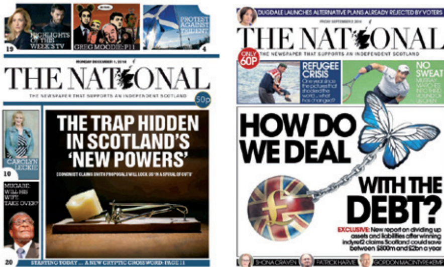
Figures 6.53 & 6.54. I want to break free... Facsimiles reproduced in accordance with the Norwegian Copyright Act.

to express, known as the “target domain” (Charteris-Black, 2004). Thus in Shakespeare’s well-known phrase “If music be the food of love, play on”, “food” and “music” are the tangible/audible vehicles for the abstract concept “love”, which they simultaneously express and bring closer to the reader’s/listener’s experience. Though the number of vehicles used by The National is large, certain patterns and repetitions can be identified. There are numerous flags (mainly saltires and EU flags), eight images deploy submarines or missiles, the target being defence spending, while another ten show maps of Scotland with varying meanings. Some of the numerous metaphors of imprisonment and entrapment (walls, barbed wire, padlocks, shackles, clamps, nooses and so on) are very striking, and range from the grim to the beautiful: