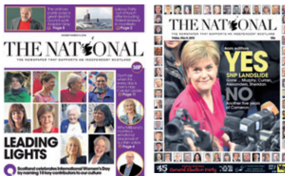
Figures 6.45 & 6.46. Individuals bound by a common purpose. Facsimiles reproduced in accordance with the Norwegian Copyright Act.

Where some level of individual identification is needed for larger groups, the technique of composite presentation is almost invariably used whereby smaller separate images of each of the individuals involved are presented. The numbers can vary from four or five through several dozen to numbers so large they are impossible to count. There are 19 cases of this type: the second image below shows Nicola Sturgeon surrounded by all the SNP Members of (the UK) Parliament elected on 8 May 2015: