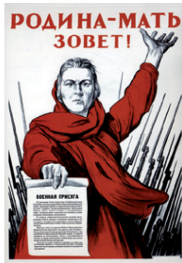
Figures 6.35 & 6.36. Propaganda-style images (copy of the Родина-Мать poster kindly supplied by the Hoover Institution Archive, Poster Collection, Poster RU/SU 2317.23R). Facsimiles reproduced in accordance with the Norwegian Copyright Act.