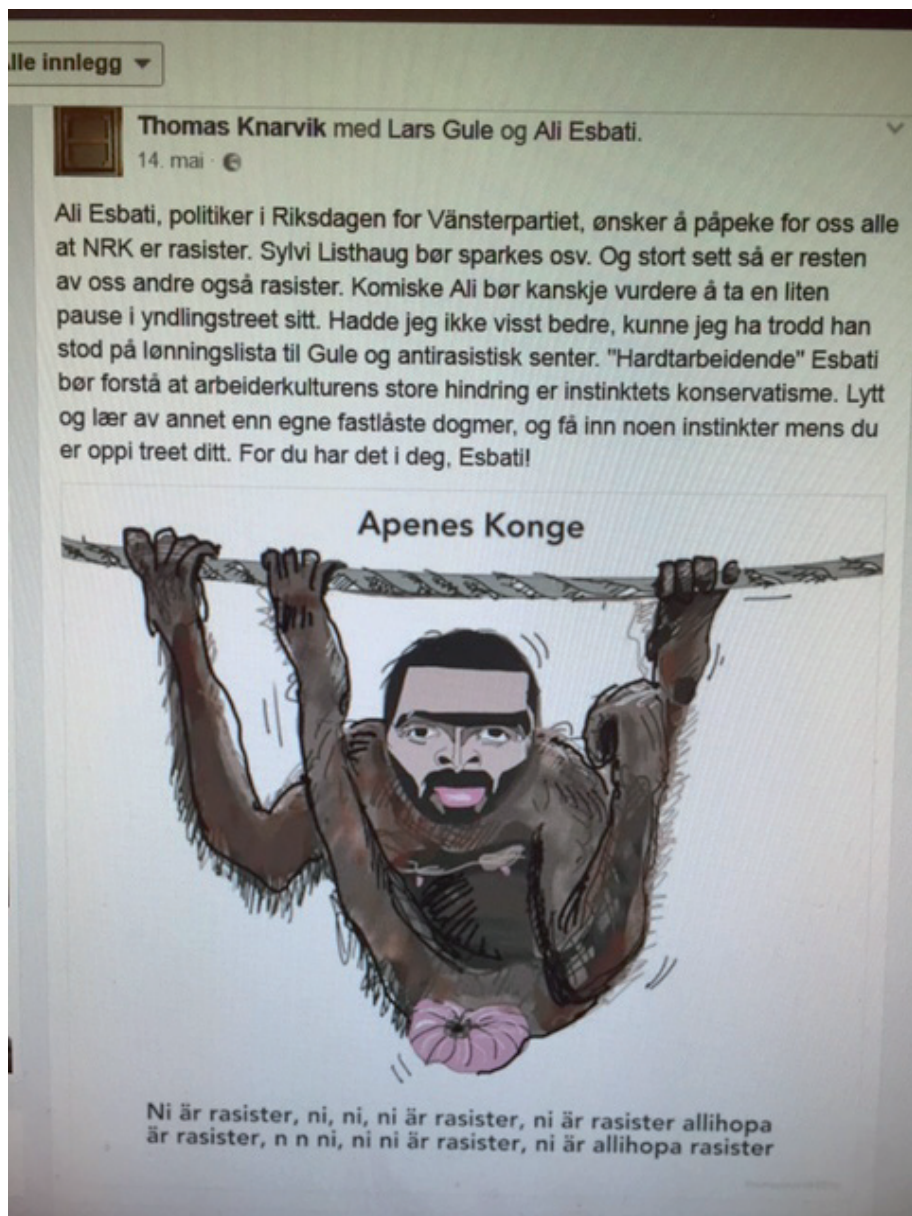
Figure 3.4. A facsimile of Thomas Knarvik's first Esbati caricature, "King of the Apes", as it appeared below a text by the drawer on his Facebook page on May 14, 2016. Facsimile reproduced in accordance with the Norwegian Copyright Act.