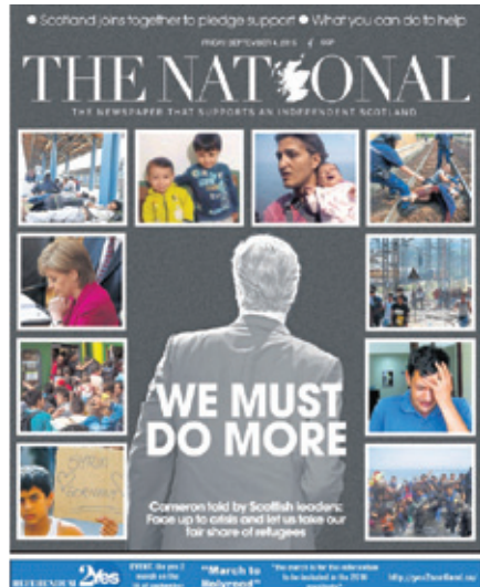
Figures 6.13 & 6.16. David Cameron in various negative guises. Facsimiles reproduced in accordance with the Norwegian Copyright Act.