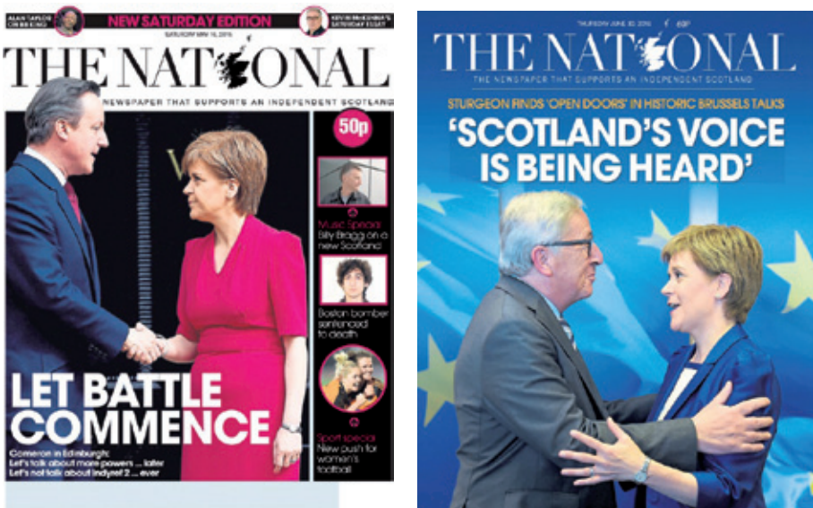
Figures 6.41 & 6.42. David Cameron, Nicola Sturgeon and Jean-Claude Juncker: a handshake vs. a warm embrace. Facsimiles reproduced in accordance with the Norwegian Copyright Act.

As regards haptics, we might usefully contrast Sturgeon's rather formal handshake with Cameron with The National's presentation of her meeting with EU President Jean-Claude Juncker: