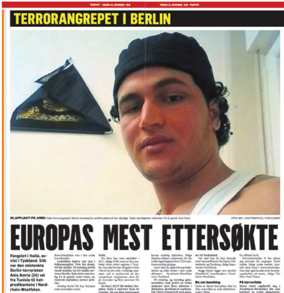
Figure 14.3. Anis Amri representing himself as a jihadist. Source: Dagbladet , 23 December 2016. Facsimile reproduced in accordance with the Norwegian Copyright Act.

question not only of academic (or human) interest, it may also be considered relevant from a security angle. It makes a significant political difference if we choose to understand Amri as inherently evil, if we blame his Christmas market terror act on potential Islamist radical forces he met in prison or after, or if we bear in mind that the obviously harsh confrontation with the European border regime in Italy may have been a catalyst in this young man's life.