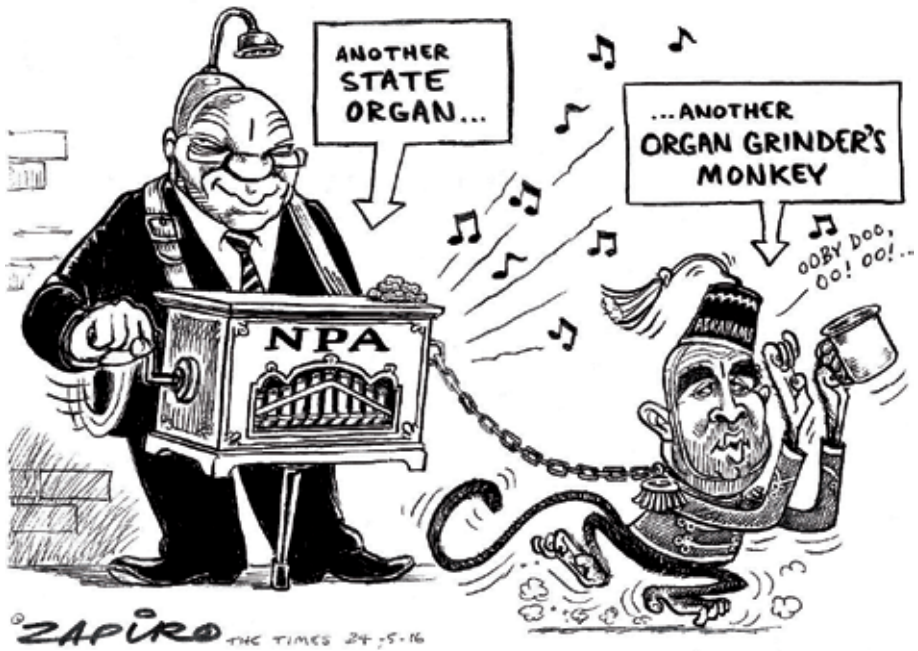
Figure 3.2. Another State Organ © Zapiro. Originally published in The Times , May 24, 2016. Reprinted with permission; no reuse without rightsholder permission.

current cultural context, or, more broadly, given the long tradition of denigrating black people by drawing them as monkeys.