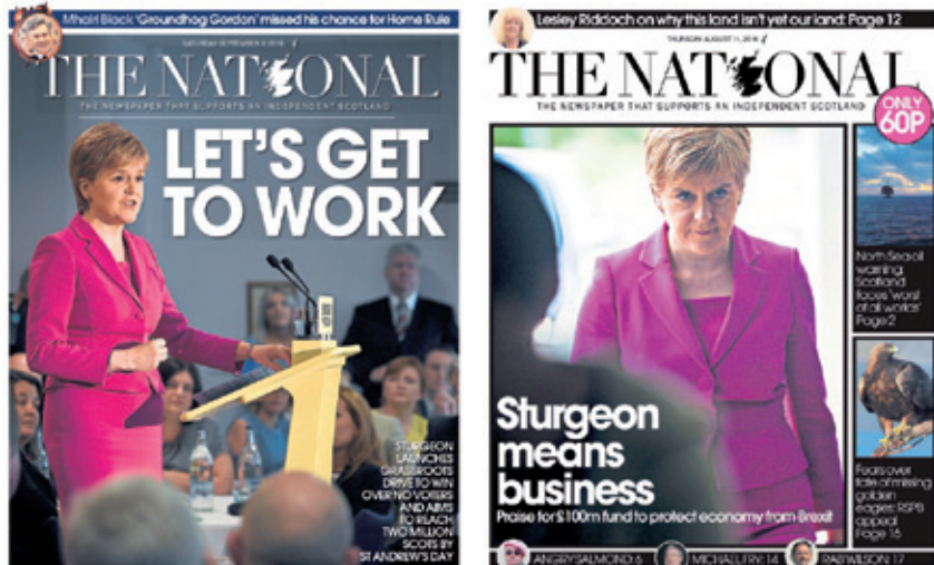
Figures 6.29 & 6.30. Nicola Sturgeon plays good cop/bad cop. Facsimiles reproduced in accordance with the Norwegian Copyright Act.

tends to be on a woman getting on with the job, an emphasis consistently underpinned by her businesslike but generally workaday dress code. Such representations can very exceptionally border on the aggressive, their unorthodox and slightly chaotic composition suggesting that things are about to get “shaken up”: