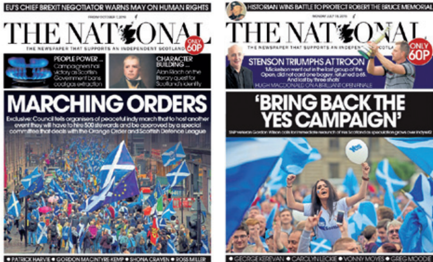
Figures 6.49 & 6.50. A question of perspective. Facsimiles reproduced in accordance with the Norwegian Copyright Act.

A number of The National's covers produced in the run-up to and after the 2014 independence referendum combined (anonymous) individual exposure with a supporting crowd. Below on the left is a largely unidentifiable crowd of independence supporters and on the right a similar crowd in close-up with one individual in particular standing out: