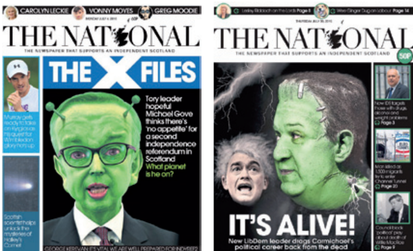
Figures 6.19 & 6.20. Anti-independence politicians Michael Gove and Alistair Carmichael in monster mode. Facsimiles reproduced in accordance with the Norwegian Copyright Act.

Appearing as a Martian or Frankenstein’s monster offer other options – the latter clearly based on Boris Karlov’s monster though totally lacking in its “redemptive” possibilities (Eco, 2011, pp. 271/295):