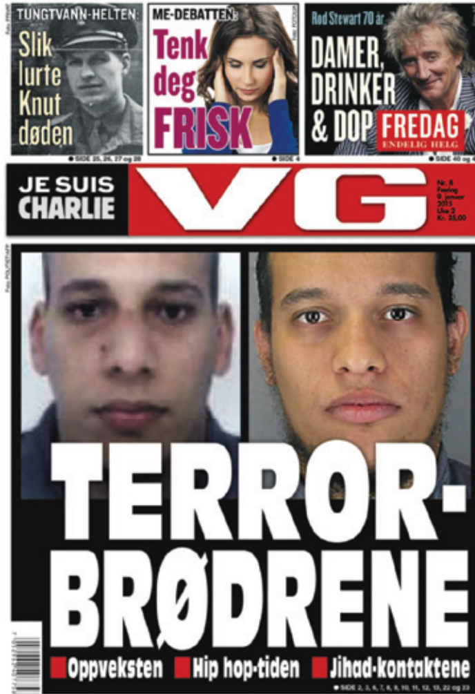
Figure 14.4. Photographs of the Kouachi brothers, highlighted as terrorist mugshots by a thick, black frame. Facsimile of the Norwegian tabloid VG, 9 January 2015. Facsimile reproduced in accordance with the Norwegian Copyright Act.