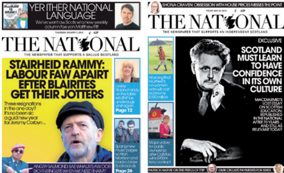
Figures 6.1 & 6.2. A National front page in Scots, and a second featuring Hugh MacDiarmid (1892-1978), Scotland's best known Scots-language poet. Facsimiles reproduced in accordance with the Norwegian Copyright Act.

however small, is not without importance for the range of subject positions now publicly available to those living in the country.