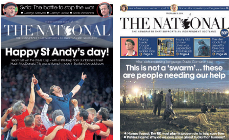
Figures 6.47 & 6.48. The comfort and loneliness of the crowd. Facsimiles reproduced in accordance with the Norwegian Copyright Act.