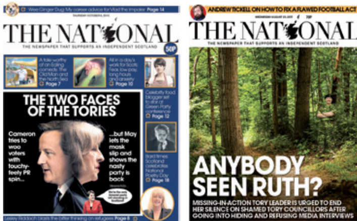
Figures 6.60 & 6.61. Ruth Davidson – irrelevant bit player in Tory in-fighting or disappearing into the background. Facsimiles reproduced in accordance with the Norwegian Copyright Act.

The Manichean nature of this universe explains many (perhaps all) of the apparent conundrums in The National’s coverage. For example, it explains why Ruth Davidson, the current leader of Scotland’s second-largest political party, did not appear in her own right on any front cover until 12 September 2016 (issue 508). While the unexpectedly good showing by her party in the snap general election held in the UK in 2017 has to some extent reversed this trend – she has now appeared on 11 front covers – images of her remain invariably negative or trivialising and her tally of front covers continues to appear paltry compared with Nicola Sturgeon’s 59 appearances: