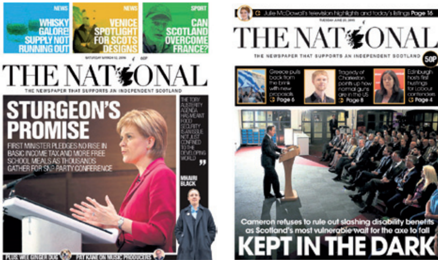
Figures 6.31 & 6.32. Nicola Sturgeon, David Cameron and the poetics of space. Facsimiles reproduced in accordance with the Norwegian Copyright Act.

A small but growing number of images show her in mid-close-up from the side addressing an obviously present but out-of-shot audience. In terms of the proxemics, we might usefully contrast this with the presentation of David Cameron in a similar style of shot: