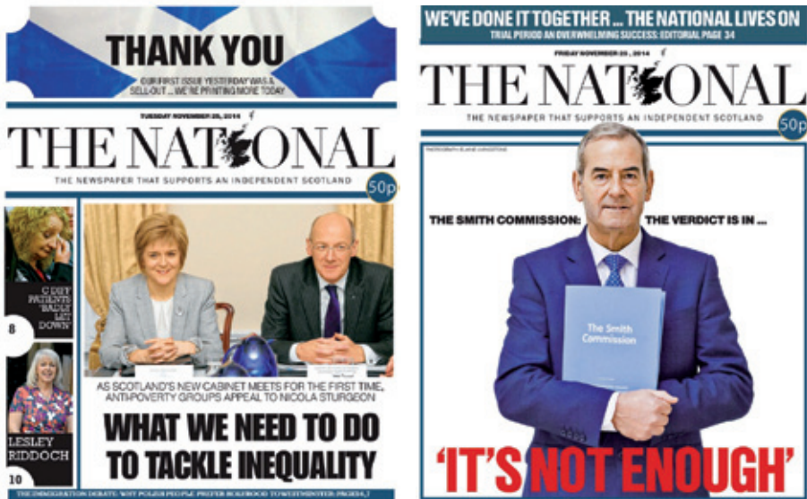
Figures 6.7 & 6.8. Nicola Sturgeon/John Swinney and Robert Smith (AKA Lord Smith of Kelvin) at “degree zero”. Facsimiles reproduced in accordance with the Norwegian Copyright Act.

Individual exposure: the bad and the ugly. Visual representations will be classified by extent of variation from Barthes’s “degree zero”: such a presentation would typically show the individual(s) concerned looking straight ahead, in the middle of the frame, and with little else in terms of posture, dress code and so on to attract particular attention (other than perhaps a smile). As he puts it elsewhere (though with reference to food), they offer a “no frills” representation (2010, p. 85):