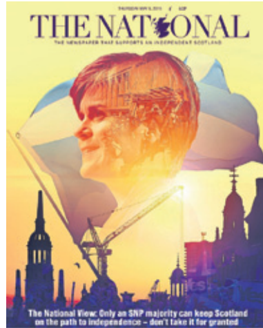
Figures 6.33 & 6.34. Nicola Sturgeon: nation and myth. Facsimiles reproduced in accordance with the Norwegian Copyright Act.