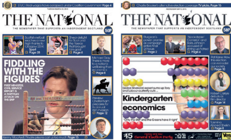
Figures 6.55 & 6.56. Danny Alexander and George Osborne fail their maths exam. Facsimiles reproduced in accordance with the Norwegian Copyright Act.

The captions clearly inform us that in the first case – featuring then Chief Secretary to the Treasury Danny Alexander – the target is financial dishonesty, whereas in the second, featuring George Osborne, the target is economic naivety and incompetence, thereby creating novel similarities between concepts not normally regarded as overlapping.