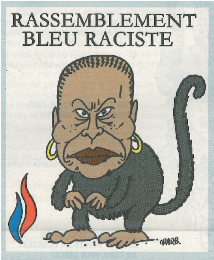
Figure 3.3. Facsimile of drawing by Stéphane Charbier (Charb), on page 16 of Charlie Hebdo No. 1115, October 2013. Facsimile reproduced in accordance with the Norwegian Copyright Act.

A reader who is not familiar with the cartoonist's subject matter may quickly jump to the conclusion that this depiction of a black person as a monkey is racist. Even if readers are familiar with the person portrayed, a hasty framing of the object of the satire as the politician Christiane Taubira herself would imply that the caricature was mocking the justice minister in a degrading