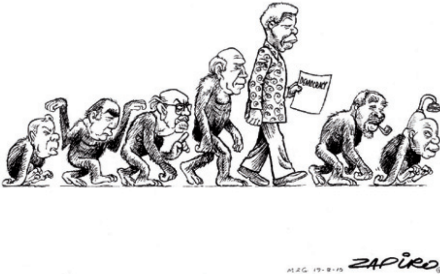
Figure 3.1. Evolution of Democracy. Originally published in Mail and Guardian, August 19, 2010. Reprinted with permission; no reuse without rightsholder permission.

become a canonical cultural icon, the depiction of the concept of evolution as a linear sequence of advancing forms. The sequence is conventionally represented as a march, moving from a stooped ape to an upright human. In this manner, the canonical image typically equates evolution with progress, and represents the human being as the apex of life's history. Zapiro has depicted, from the left, heads of state in South Africa during the apartheid era: Hendrik Verwoerd, B.J. Vorster, P.W. Botha and F.W. de Klerk. To the right of them are the country's post-apartheid presidents: Nelson Mandela, Thabo Mbeki and Jacob Zuma.