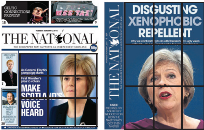
Figures 6.9 & 6.10. The rule of thirds applied to Nicola Sturgeon and Theresa May. Facsimiles reproduced in accordance with the Norwegian Copyright Act.

Immediately below is the third image to appear in The National (chronologically speaking) and featuring Jim Murphy, then leader of the Scottish Labour party and one of the most high-profile representatives of the “No” camp during the referendum. As can be seen, the slightest change in the direction of his gaze is enough to move his representation from neutral to decidedly “shifty”, while a perplexed-looking Jeremy Corbyn peering over his glasses looks like someone out of his depth: