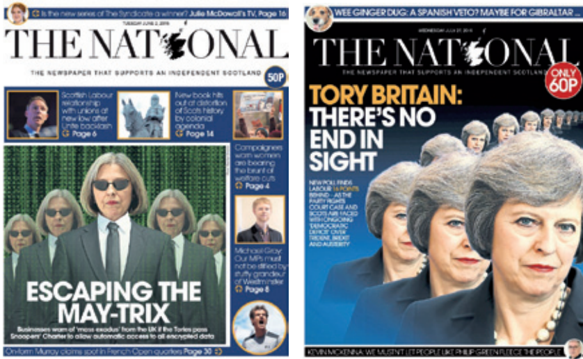
Figures 6.27 & 6.28. Theresa May ad infinitum... Facsimiles reproduced in accordance with the Norwegian Copyright Act.

tends to be on a woman getting on with the job, an emphasis consistently underpinned by her businesslike but generally workaday dress code. Such representations can very exceptionally border on the aggressive, their unorthodox and slightly chaotic composition suggesting that things are about to get “shaken up”: