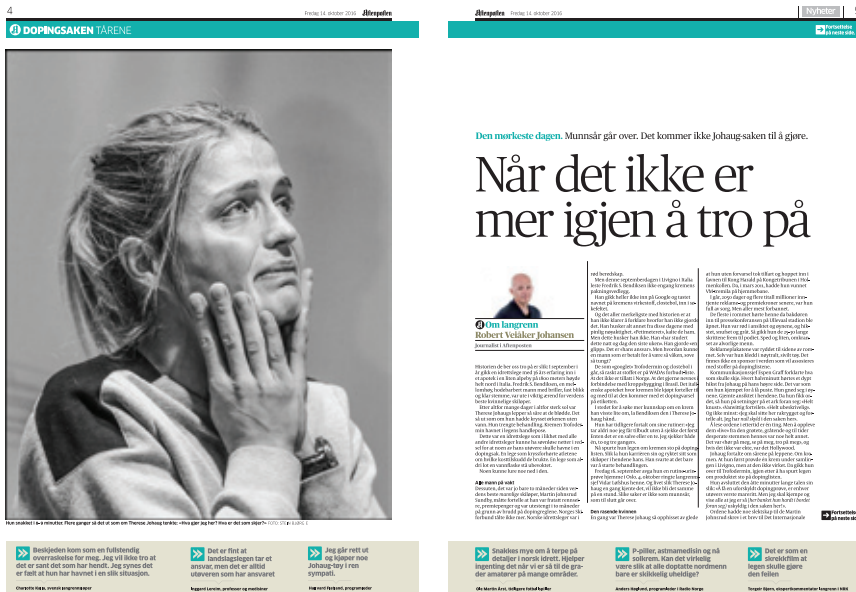
Figure 9.5. Page 4–5, Aftenposten 14.10.16. Facsimile reproduced in accordance with the Norwegian Copyright Act.

This photo establishes a part of the story, which continues in the verbal text on the following pages, labeled “The tears”. This caption introduces a kind of omnipotent narrator, the journalist expressing what it looked like Johaug was thinking and feeling: “She talked for 8-9 minutes. Several times, it looked as if Therese Johaug was thinking, ‘What am I doing here? What is going on?’” The photo is in black and white, which makes it appear less in touch with reality, and less as something happening “here and now”. Black and white photos are often seen as connecting to the past. There may also be another form of symbolism in this; a way of suggesting that this is not necessarily picturing the