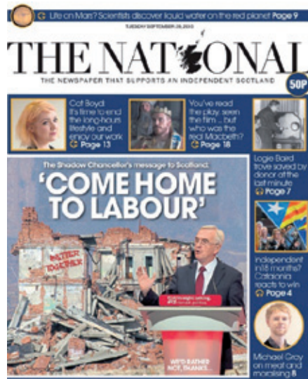
Figures 6.51 & 6.52. The destruction of Syria vs. the collapse of the British Labour Party. Facsimiles reproduced in accordance with the Norwegian Copyright Act.