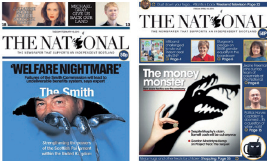
Figures 6.57 & 6.58. The stuff of nightmares. Facsimiles reproduced in accordance with the Norwegian Copyright Act.

Despite the diversity of images and metaphors, this Manichean universe structures The National's discursive output from top to bottom and from side to side, and so far has remained entirely consistent throughout the paper's relatively short existence. While the negative axis of this matrix is the politics of austerity, the positive side is not simply independence – i.e. statehood – but a symbiotic fusion of independence and social democracy. The longest caption to date appeared on 11 November 2016, a few days after the US elections, and exceptionally taking up more than half the page. It read, quoting Nicola Sturgeon: