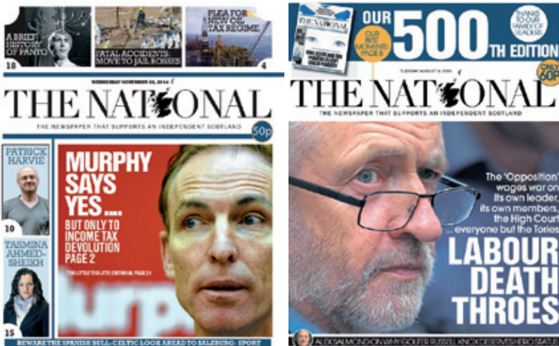
Figures 6.11 & 6.12. Jim Murphy and Jeremy Corbyn avoid the camera’s gaze. Facsimiles reproduced in accordance with the Norwegian Copyright Act.

Immediately below is the third image to appear in The National (chronologically speaking) and featuring Jim Murphy, then leader of the Scottish Labour party and one of the most high-profile representatives of the “No” camp during the referendum. As can be seen, the slightest change in the direction of his gaze is enough to move his representation from neutral to decidedly “shifty”, while a perplexed-looking Jeremy Corbyn peering over his glasses looks like someone out of his depth: