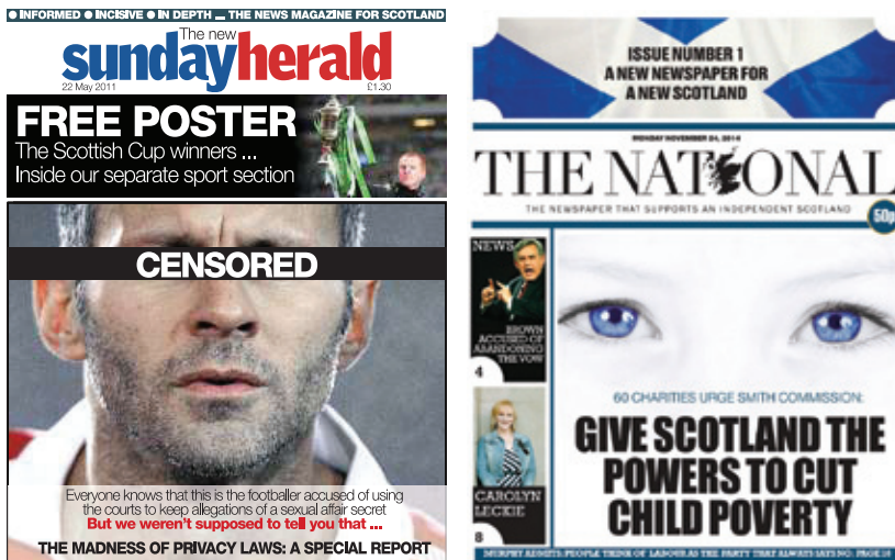
Figures 6.3 & 6.4. Front-cover designs in the Sunday Herald and The National . Facsimiles reproduced in accordance with the Norwegian Copyright Act.