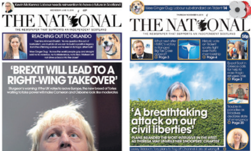
Figures 6.21 & 6.22. Boris Johnson and Theresa May only half there. Facsimiles reproduced in accordance with the Norwegian Copyright Act.

As we slide further down the negative slope only part of the individual in question might be shown. Below we see Boris Johnson almost literally as a “half-wit” while half of a snooping Theresa May disappears behind a hedge: