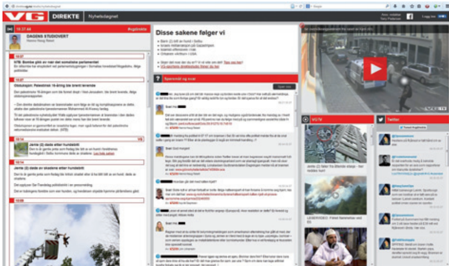
Figure 7.1. VG Direkte Nyhetsdøgnet 5.7.2014 10.37 a.m. Facsimile reproduced in accordance with the Norwegian Copyright Act.

particularly interested in the implicit text norms for interpersonal symmetry and subjectivity. My research question is: Which interpersonal relations are established between journalists and readers in VG.no's Q&A forum, and how subjective are the participants?