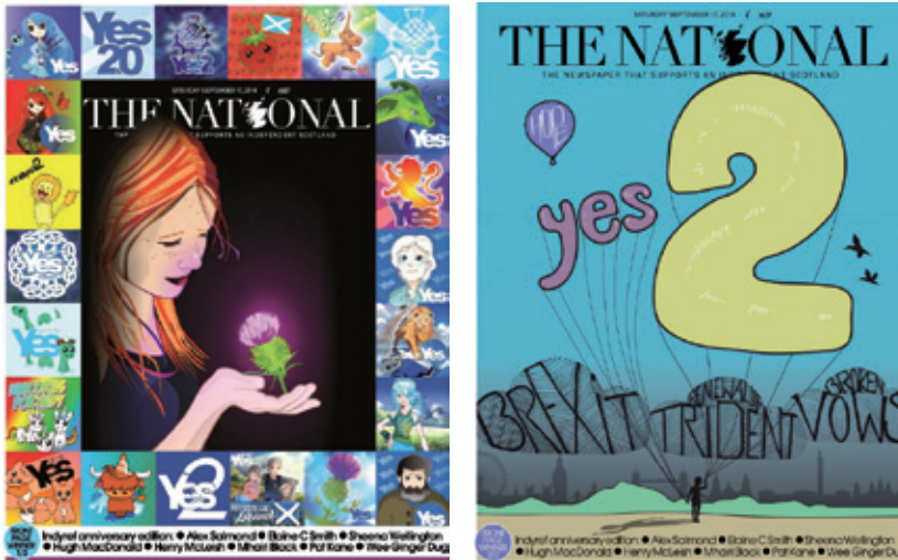
Figures 6.5 & 6.6. Two prize-winning front covers. Facsimiles reproduced in accordance with the Norwegian Copyright Act.

The great importance The National gives to its front covers was clear from issue 1 (shown above). This combined a metaphor of the Fourth Estate “watch-dog” function of the press (“we have our eye on you”) with the social issue of child poverty. On 8 May 2015 it published no fewer than three different covers related to the Scottish parliamentary elections the day before (the third appears as Figure 6.46 below), while on 17 September 2016 it published two different covers, these having been selected from designs sent in by readers (in the first immediately above, the thistle is a long-standing emblem of Scotland, while the “2” in the second refers to “indyref2”, an abbreviation widely used to refer to the possibility of a second independence referendum).