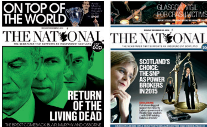
Figures 6.43 & 6.44. Anti-independence politicians (Blair, Murphy and Osborne) as zombies vs. a serene Nicola Sturgeon surveying Miliband and Osborne. Facsimiles reproduced in accordance with the Norwegian Copyright Act.

Images featuring three actors can suggest more complex power relationships, often enhanced through the use of CGI as illustrated below: