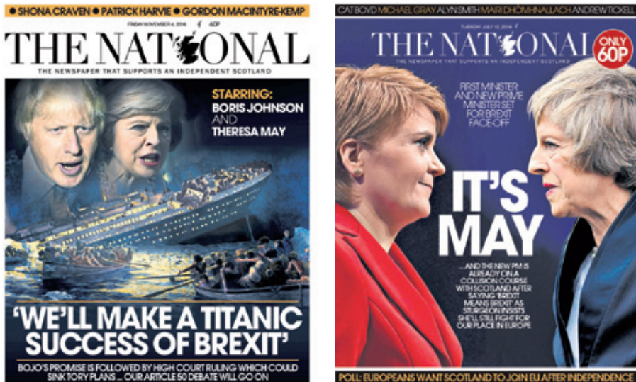
Figures 6.37 & 6.38. Theresa May sinking with Boris Johnson vs. squaring up to Nicola Sturgeon. Facsimiles reproduced in accordance with the Norwegian Copyright Act.

Small Group Exposure. The slightly greater number of actors present in small-group exposure enables additional semiotic resources to be mobilised highlighting, for example, that individuals are somehow “in the same boat” or on opposite sides of an argument: