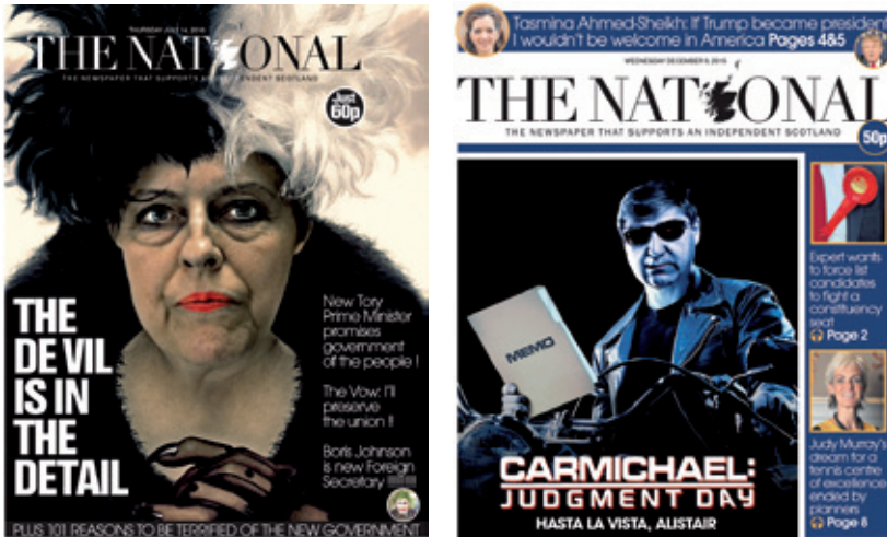
Figures 6.25 & 6.26. Theresa May and Alistair Carmichael in pop-culture alter egos. Facsimiles reproduced in accordance with the Norwegian Copyright Act.

Or perhaps not. The ultimate indignity may be to have your identity hijacked by a character from popular culture, the images below showing Theresa May as Cruella de Vil and Alistair Carmichael as The Terminator: